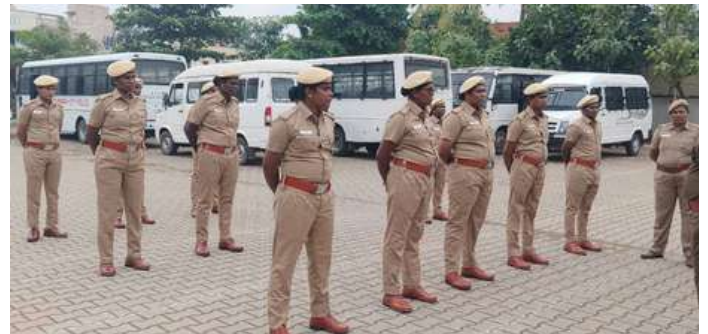
Passing out Parade with the Uniforms sponsored by the Clubs