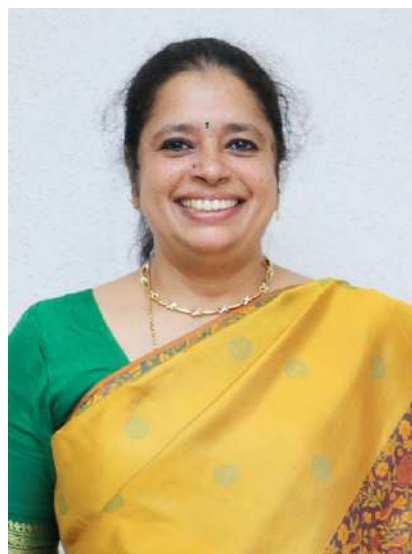
RCC Sagar Team 2025-26